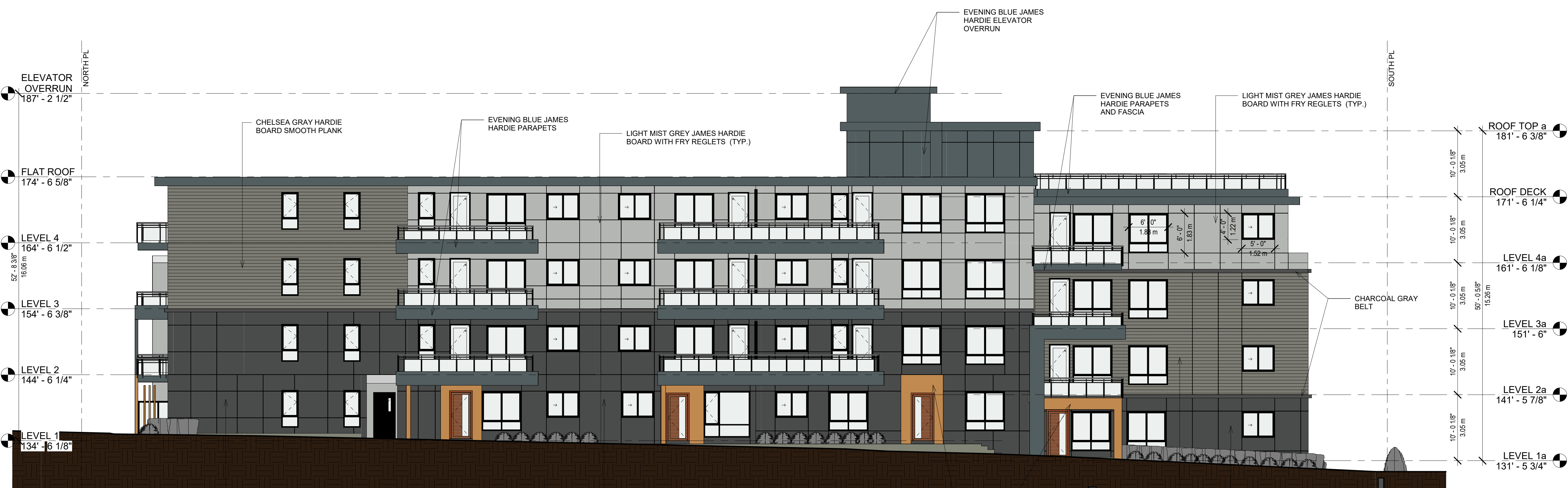
② WEST ELEVATION 1 : 100

THIS DRAWING MUST NOT BE SCALED. THE GENERAL CONTRACTOR SHALL VERIFY ALL DIMENSIONS AND LEVELS PRIOR TO COMMENCEMENT OF WORK. ALL ERRORS AND OMISSIONS SHALL BE REPORTED IMMEDIATELY TO THE ARCHITECT. COPYRIGHT RESERVED. THIS PLAN AND DESIGN ARE AND AT ALL TIMES REMAIN THE EXCLUSIVE PROPERTY OF MATTHEW CHENG ARCHITECT INC. AND MAY NOT BE USED OR REPRODUCED WITHOUT PRIOR WRITTEN CONSENT.