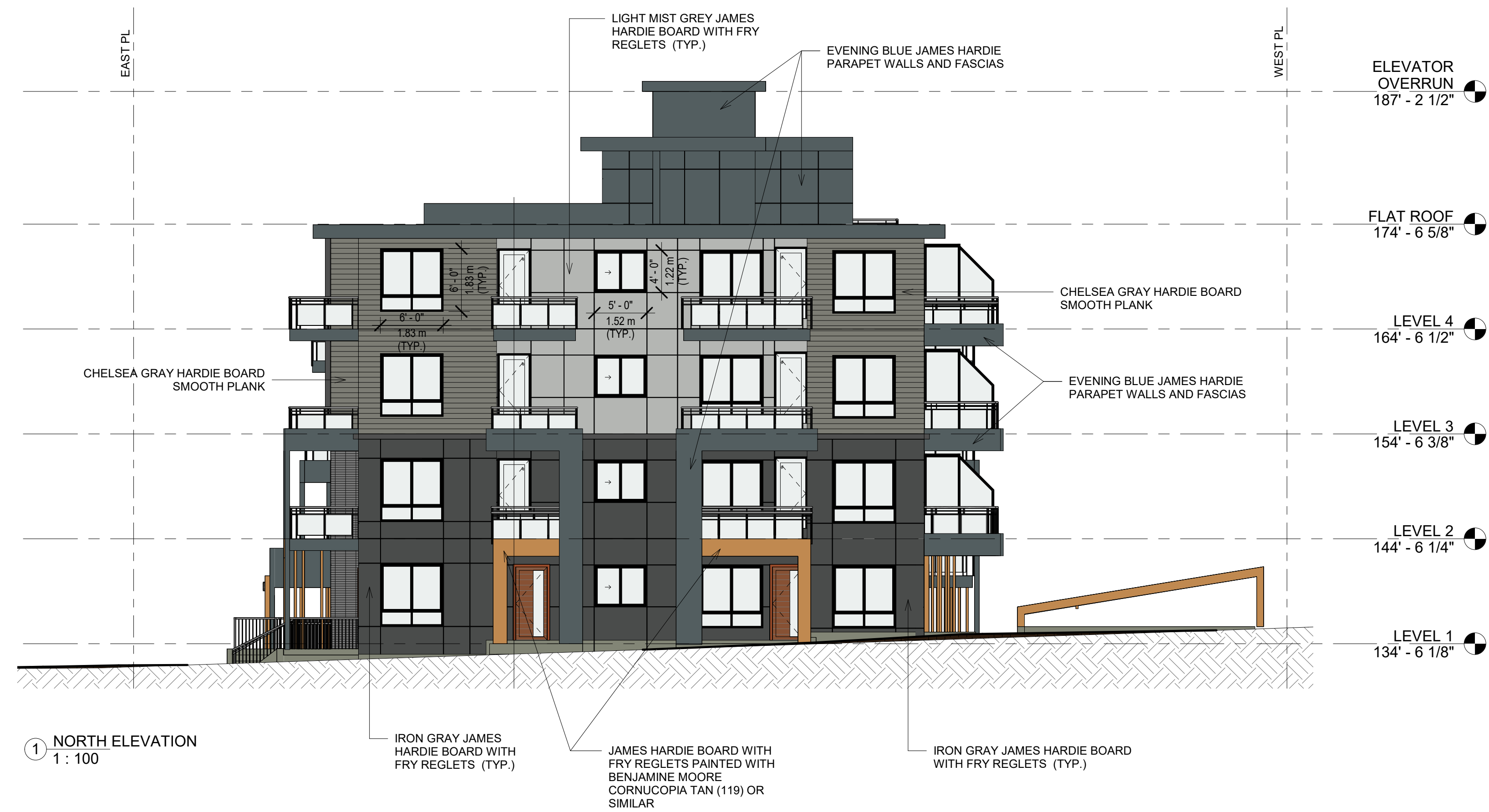
① NORTH ELEVATION 1:100