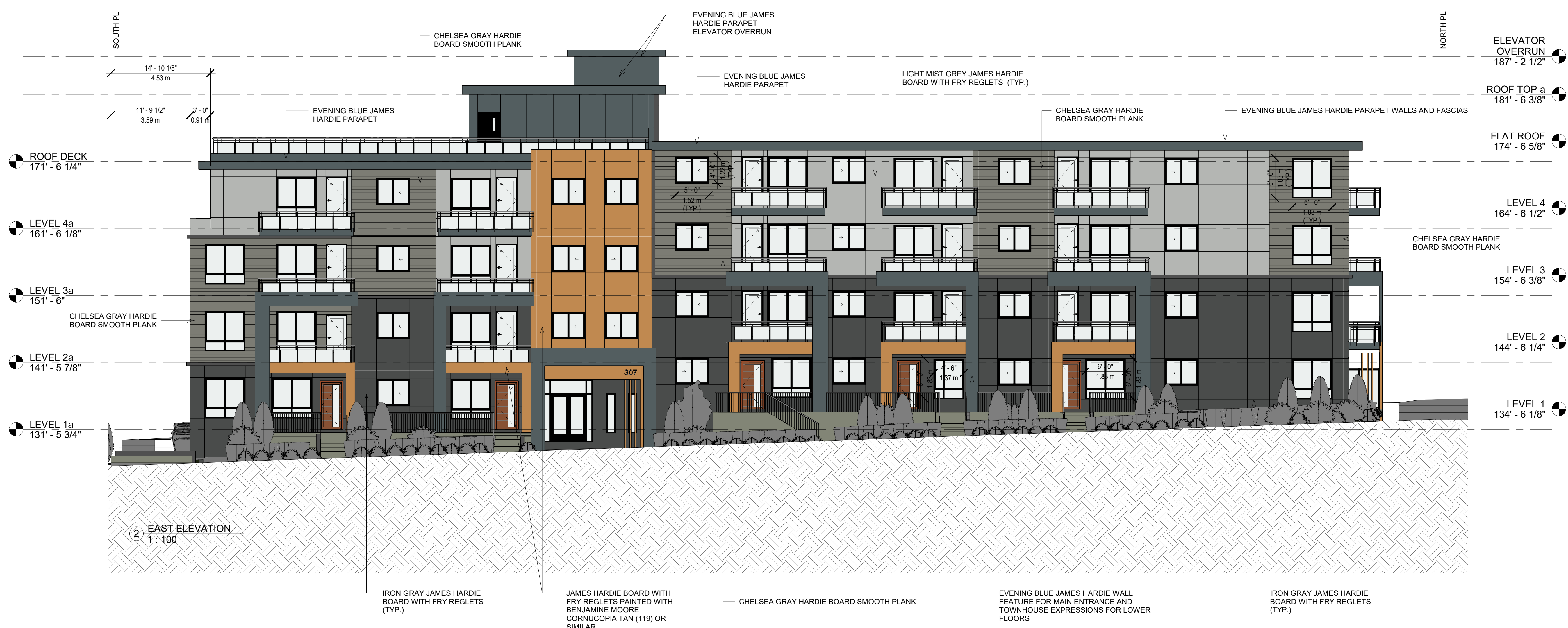
② EAST ELEVATION 1:100

THIS DRAWING MUST NOT BE SCALED. THE GENERAL CONTRACTOR SHALL VERIFY ALL DIMENSIONS AND LEVELS PRIOR TO COMMENCEMENT OF WORK. ALL ERRORS AND OMISSIONS SHALL BE REPORTED IMMEDIATELY TO THE ARCHITECT. COPYRIGHT RESERVED. THIS PLAN AND DESIGN ARE AND AT ALL TIMES REMAIN THE EXCLUSIVE PROPERTY OF MATTHEW CHENG ARCHITECT INC. AND MAY NOT BE USED OR REPRODUCED WITHOUT PRIOR WRITTEN CONSENT.